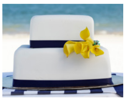
Design your cake