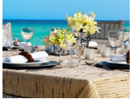
Select your centerpiece