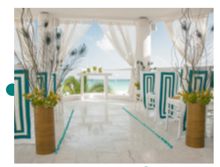
Choose your location