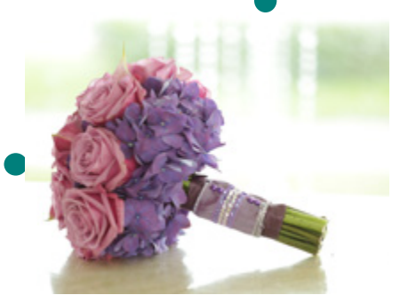
Choose your bouquet