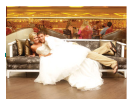
Leave stress behind, enjoy!