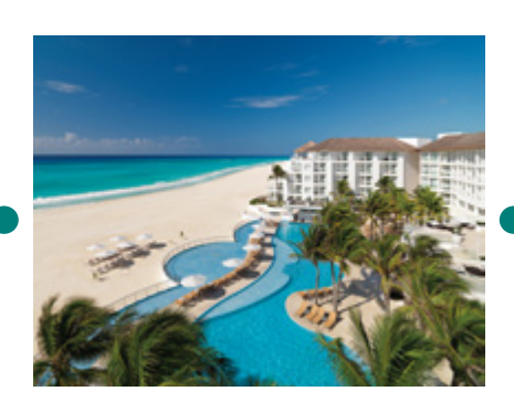
Book your stay including date and time of your ceremony