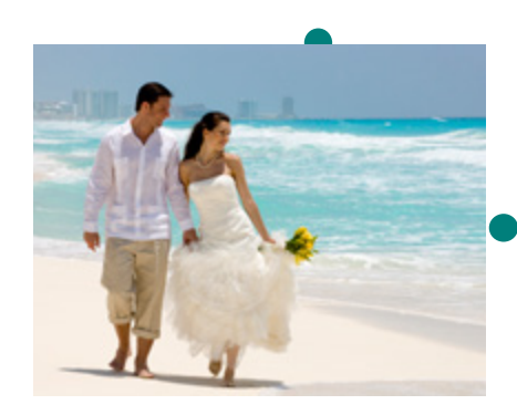
Select your photo package